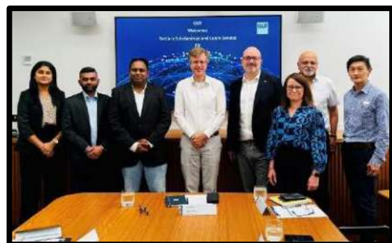
TSLS team with the QUT team