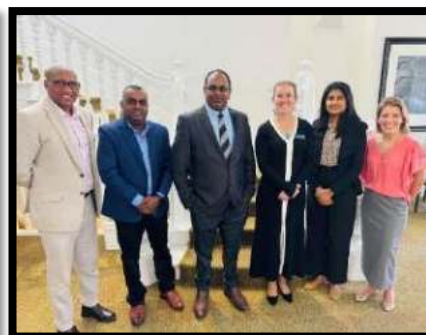
University of Auckland