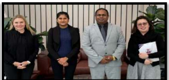
Royal Melbourne Institute of Technology