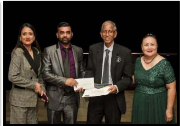
Fiji Medical Association Awards Night