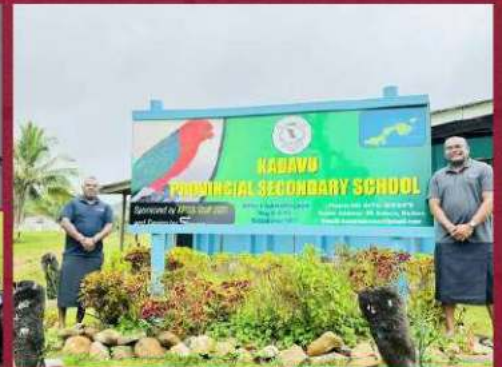
NATIONWIDE SCHOOL VISIT