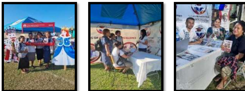
Festival of the Friendly North