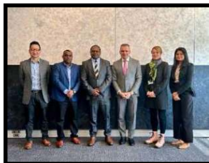
Auckland University of Technology

These visits are integral to strengthening our long-standing partnership and advancing our commitment to achieving demand-driven human capital development outcomes for Fiji. The purpose of the visit was also to discuss the expansion of our existing scholarship agreement, with a specific emphasis on addressing Fiji's need for enhanced human resource capacity through postgraduate education and research initiatives.