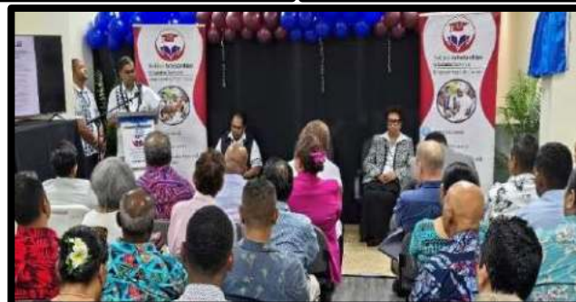
TSLS Nadi Office Opening Event