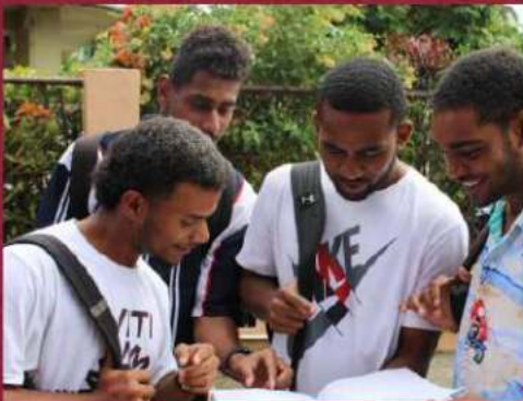
EMPOWERING FIJI'S FUTURE