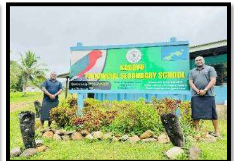
TSLS staff with Year 12 & Year 13 students