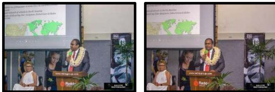
Pivot Point Graduation Ceremony

Special awards included the Creative Award, Principal's Award, and Excellence Award Hairdressing.