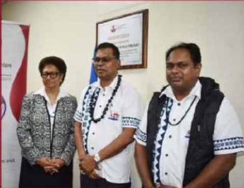
INCREASED PUBLIC ACCESS

Tertiary Scholarships & Loans Service Empowering Fiji's Future