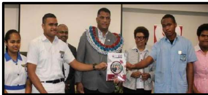
Minister for Education, Hon. Aseri Radrodro, Board Chairperson & CEO of TSLS with future recipients of scholarships.

The launch was done by the Minister for Education, Hon. Aseri Radrodro. The Handbook is designed to provide useful information to all prospective recipients and members of the public on twelve (12) schemes of scholarships, one (1) study loan scheme, and three (3) schemes of study grants.