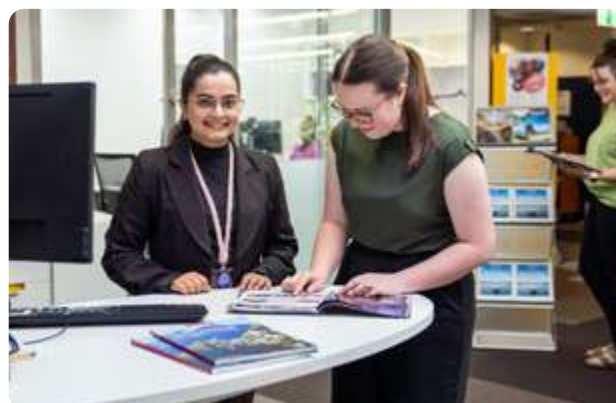
Fully equipped libraries and study hubs.