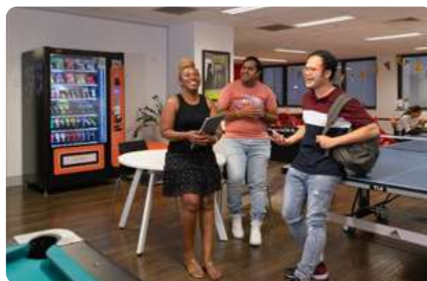
Social spaces, lounges and cafés.