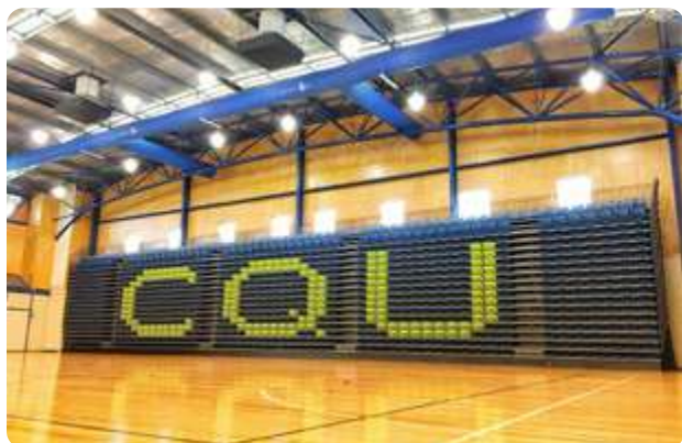
Sports centre, outdoor courts and gyms.

Our campuses feature modern, state-of-the-art teaching and learning facilities with well-equipped study areas as well as recreational spaces to socialise.