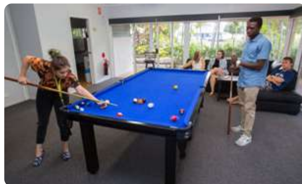
Area 51 Common Room, Canefield College.