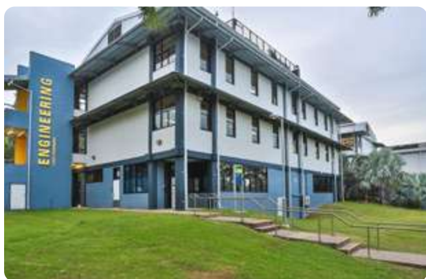
Engineering precinct and allied health clinics.