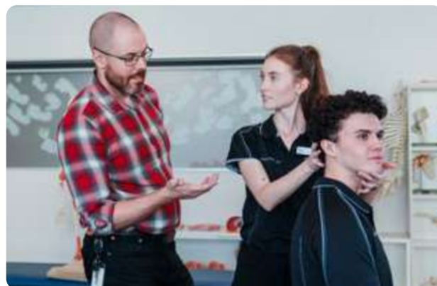
Clinical learning experiences.