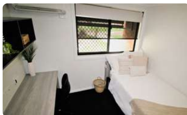
McCall Air Con Room, Capricornia College.