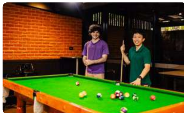
JCR Room, Capricornia College.