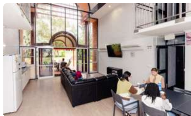
Gutey House, Capricornia College.

Renting an apartment or a house with housemates is ideal for meeting new people and reducing your costs. If you decide to live alone, you will have to pay for all costs. Rentals come either furnished or unfurnished and you can find these through property websites such as realestate.com.au and domain.com.au .